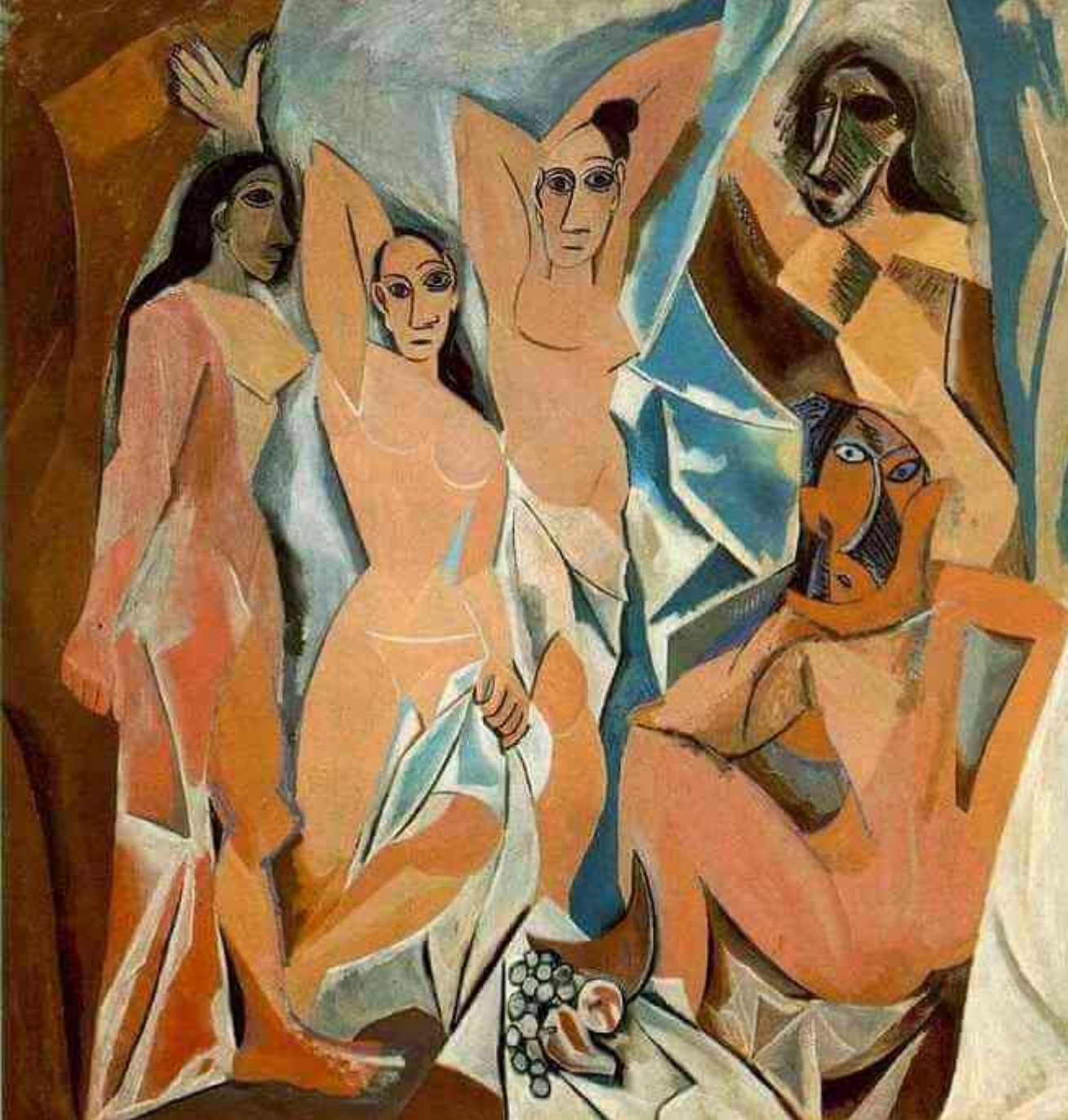
Pablo Picasso Les Femmes d'Alger Paris, June-July 1907

Les Femmes d'Alger, was painted in 1907 and is the most famous example of cubism painting.