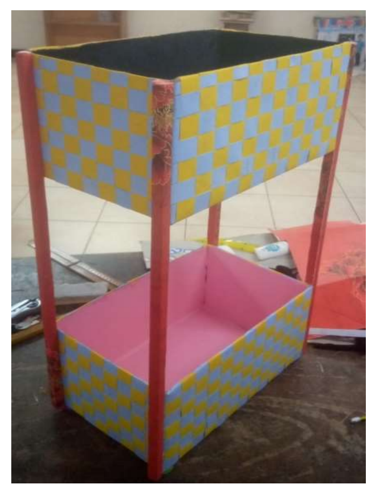
Shelve stands attached to cartons