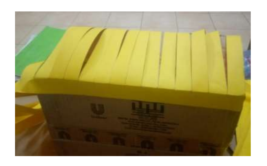
Warp strips laid on the carton