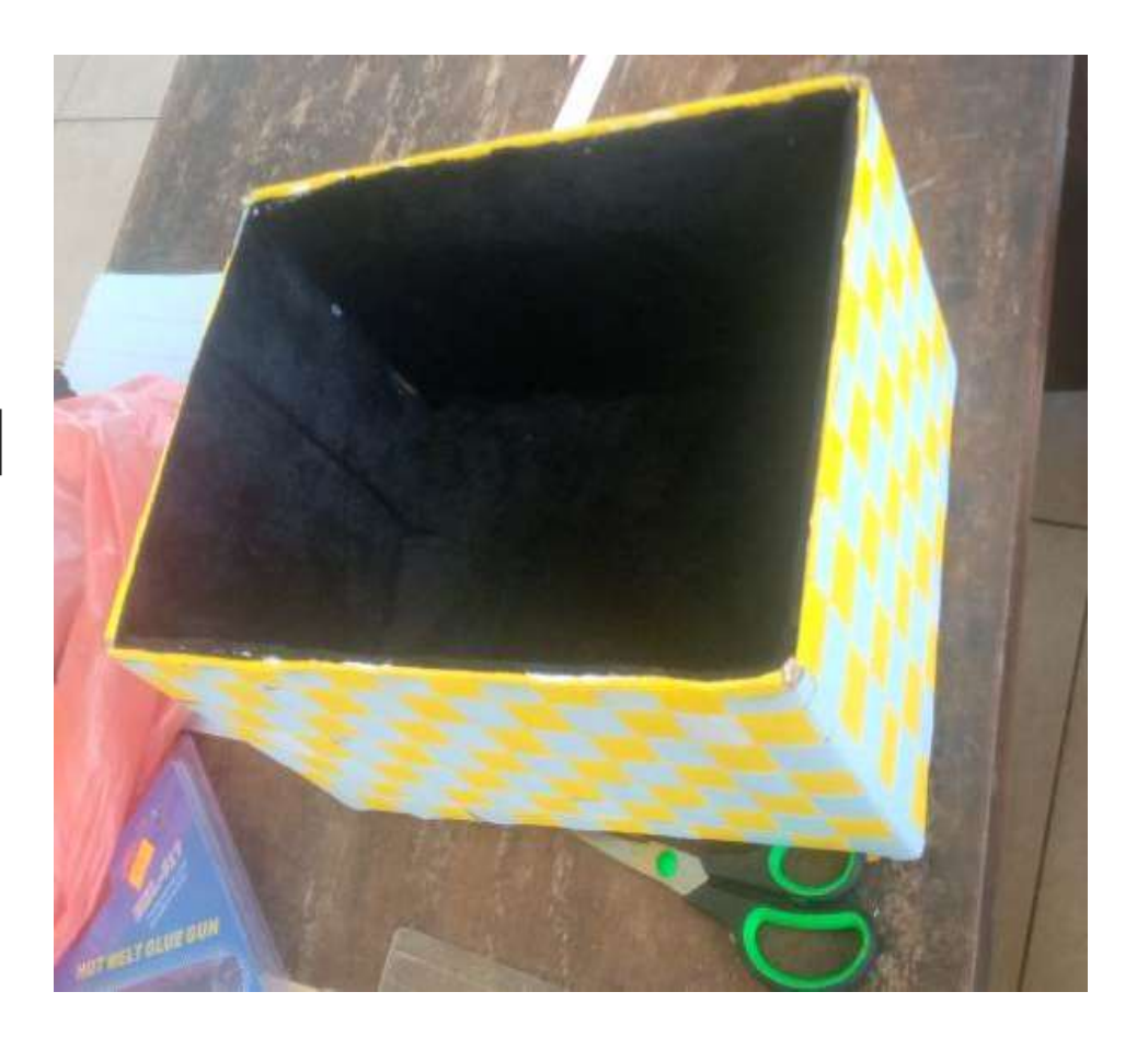
Carton lined with fabric off cut