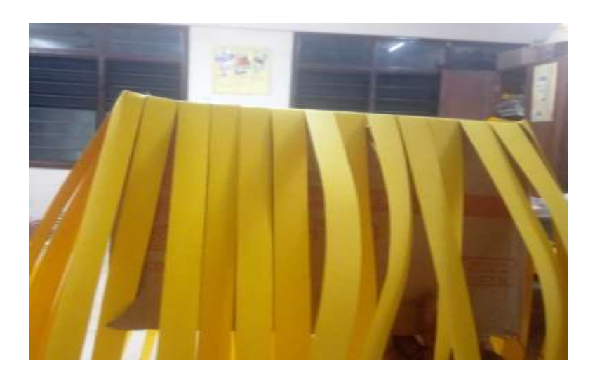
Warp strips hanging on the side of the carton