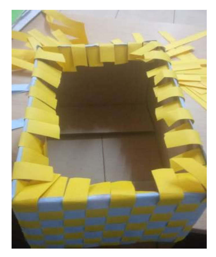
Trimmed warp strands

Trim away any extra warp. The warp needs to be cut more than an inch above the carton's height.