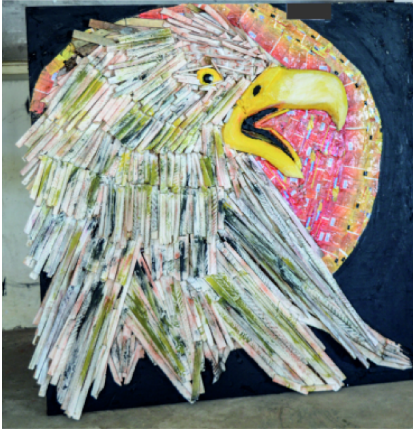
Frederick Ackun, Superior Material: Plastic Wastes