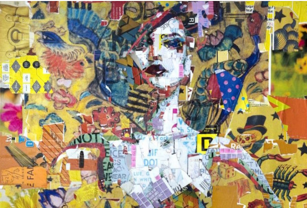
Derek Gores, Full Volume Klimt 7

Material: Shredded magazine paper, labels and other recycled materials