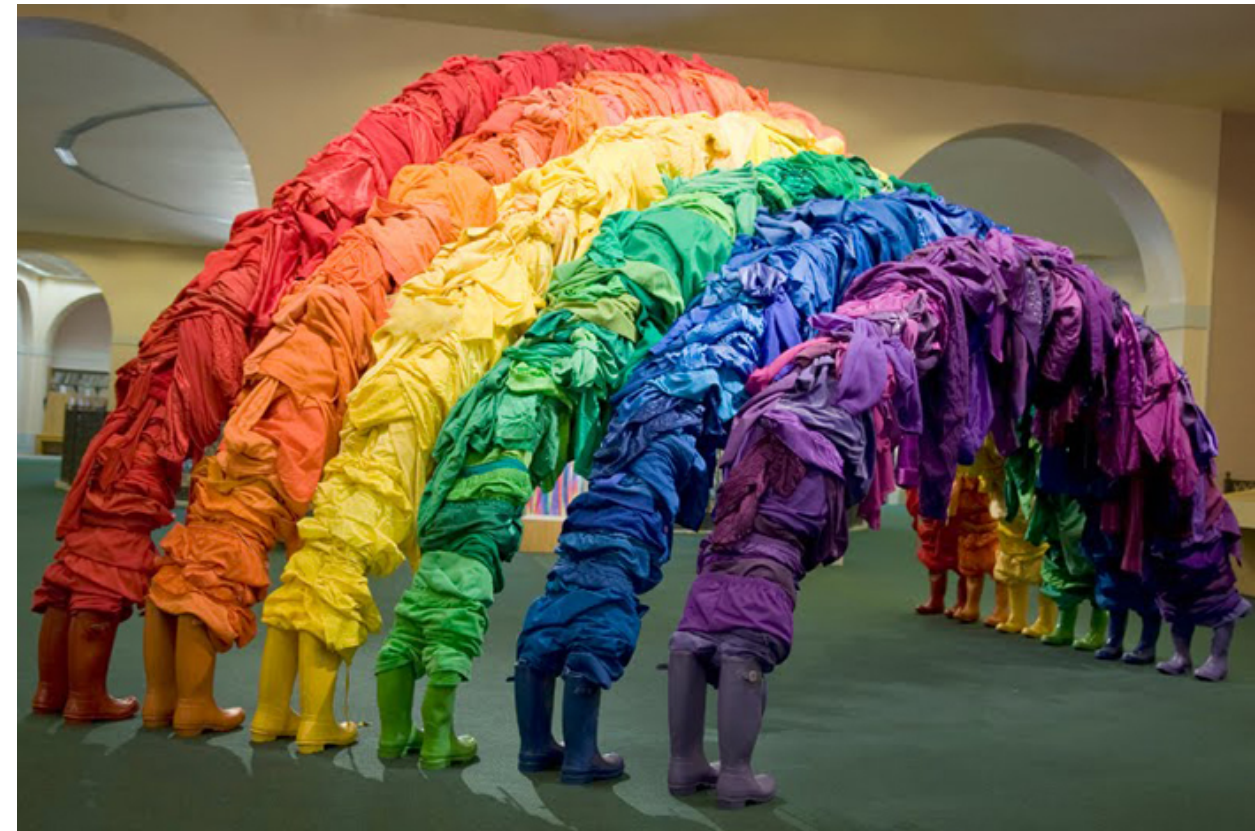
Guerra de la Paz, Indradhanush Material: Recycled clothing