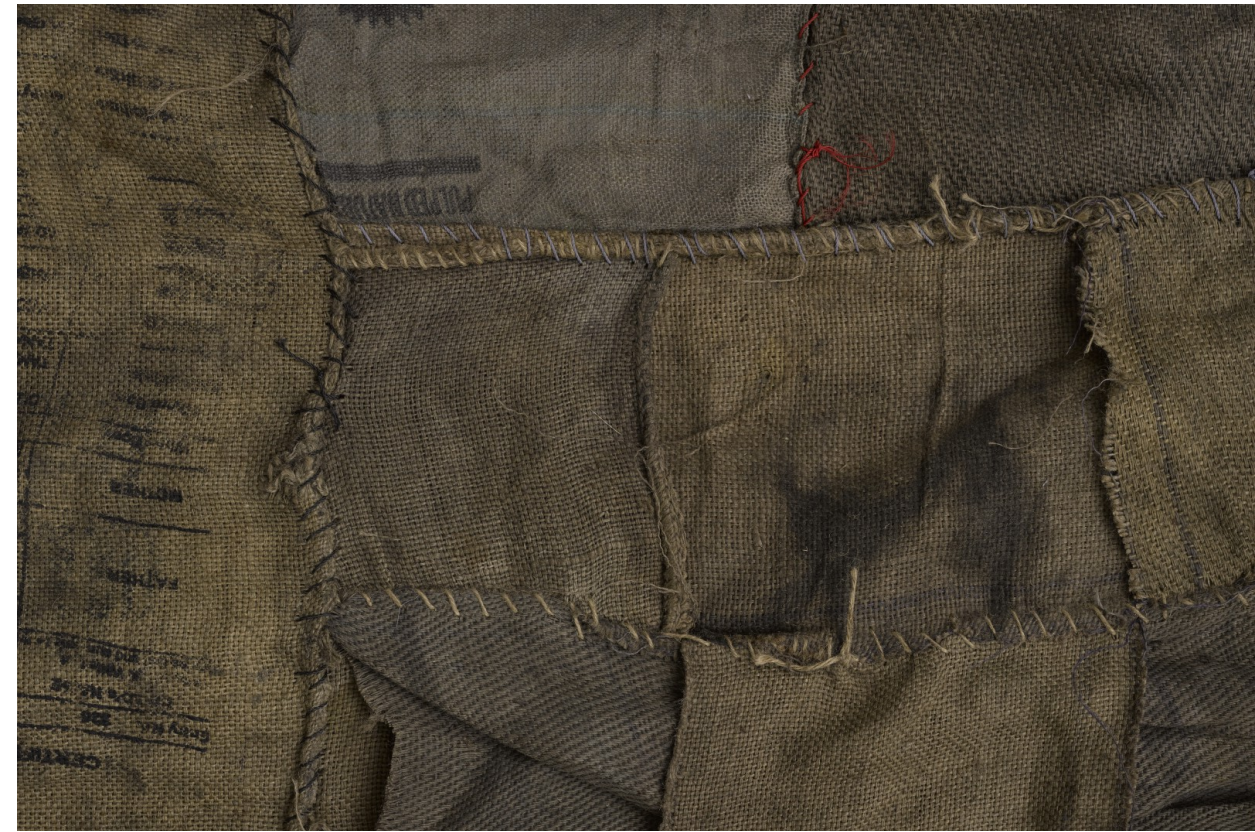
Ibrahim Mahama, Ziza Sullo Material: Scrap metal tarpaulin and metal tags on charcoal sacks