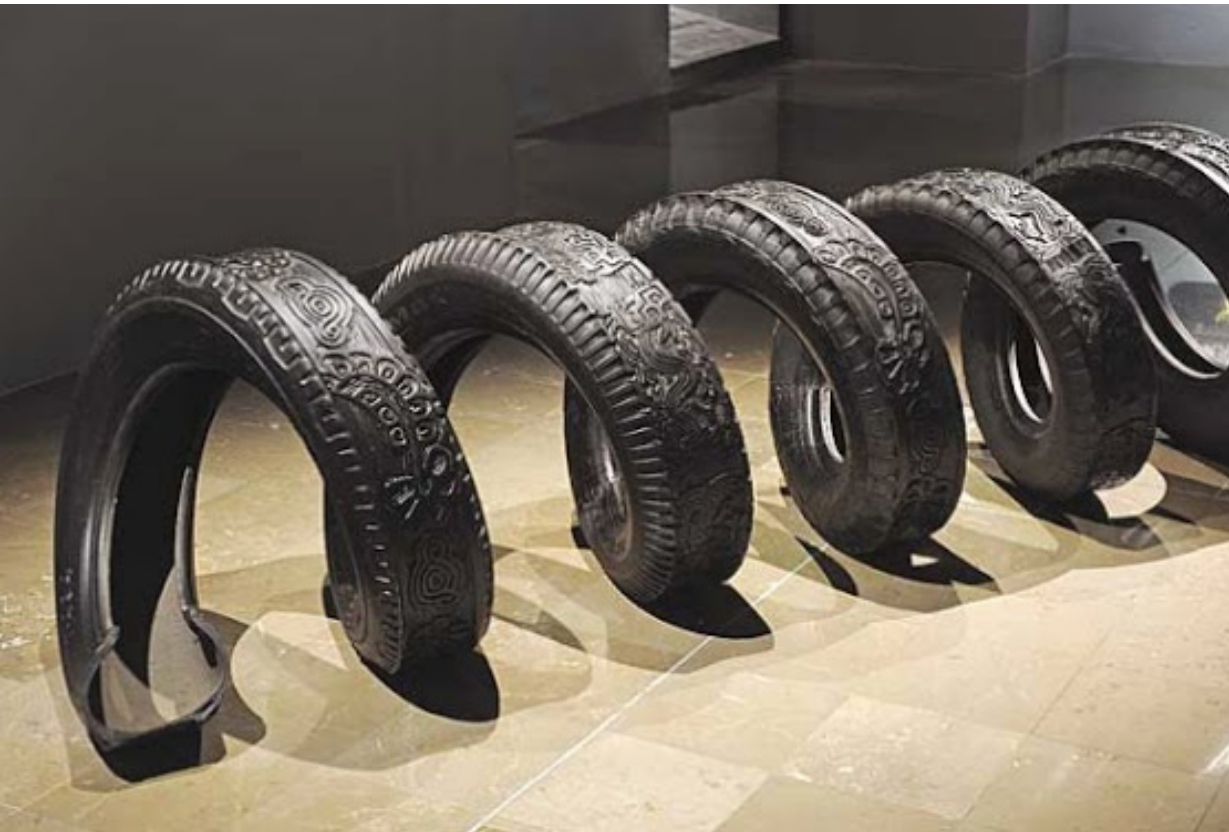
Wim Delvoye, Spiral Tires Material: Used car tires