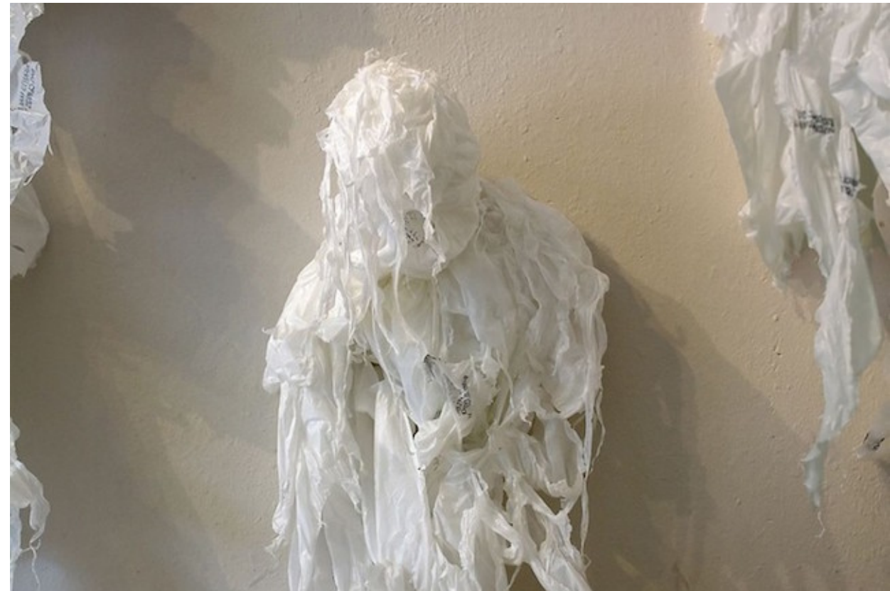
Khalil Chishtee, Plastic bag sculptures Material: Recycled plastic bags