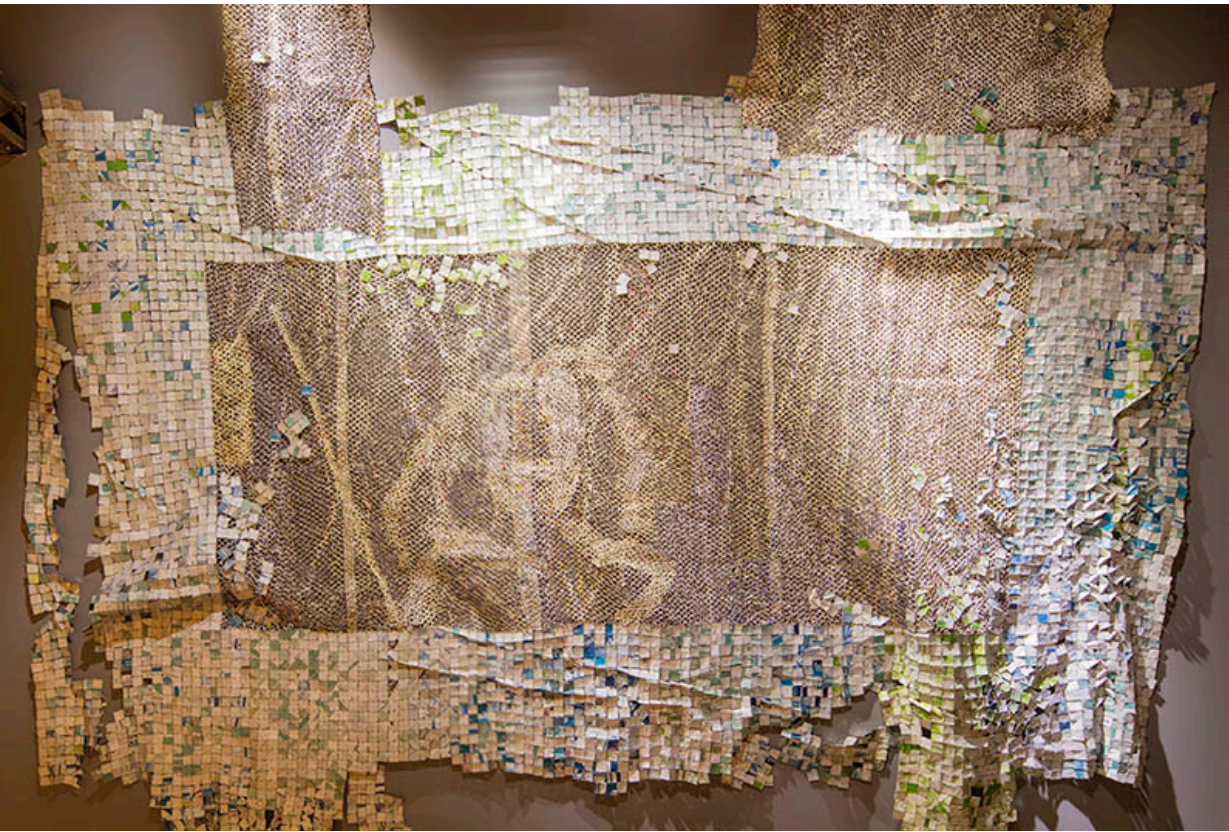
El Anatsui, Yaw Berko (Wall hanging); Materials: Aluminum (liquor bottle caps) and copper wire