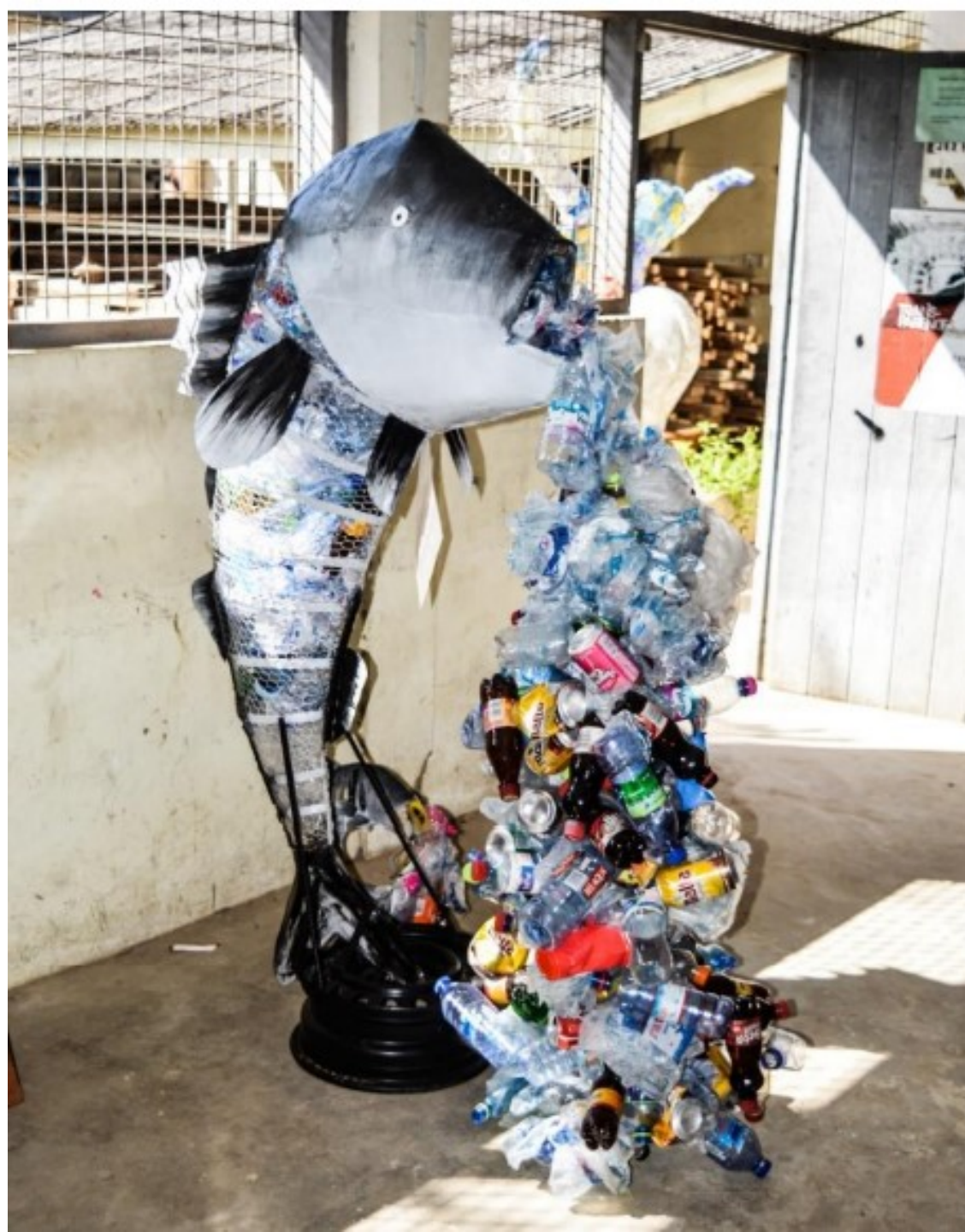
Eric Owusu, You Drink, I Die Material: Plastic and canned drinks wastes.