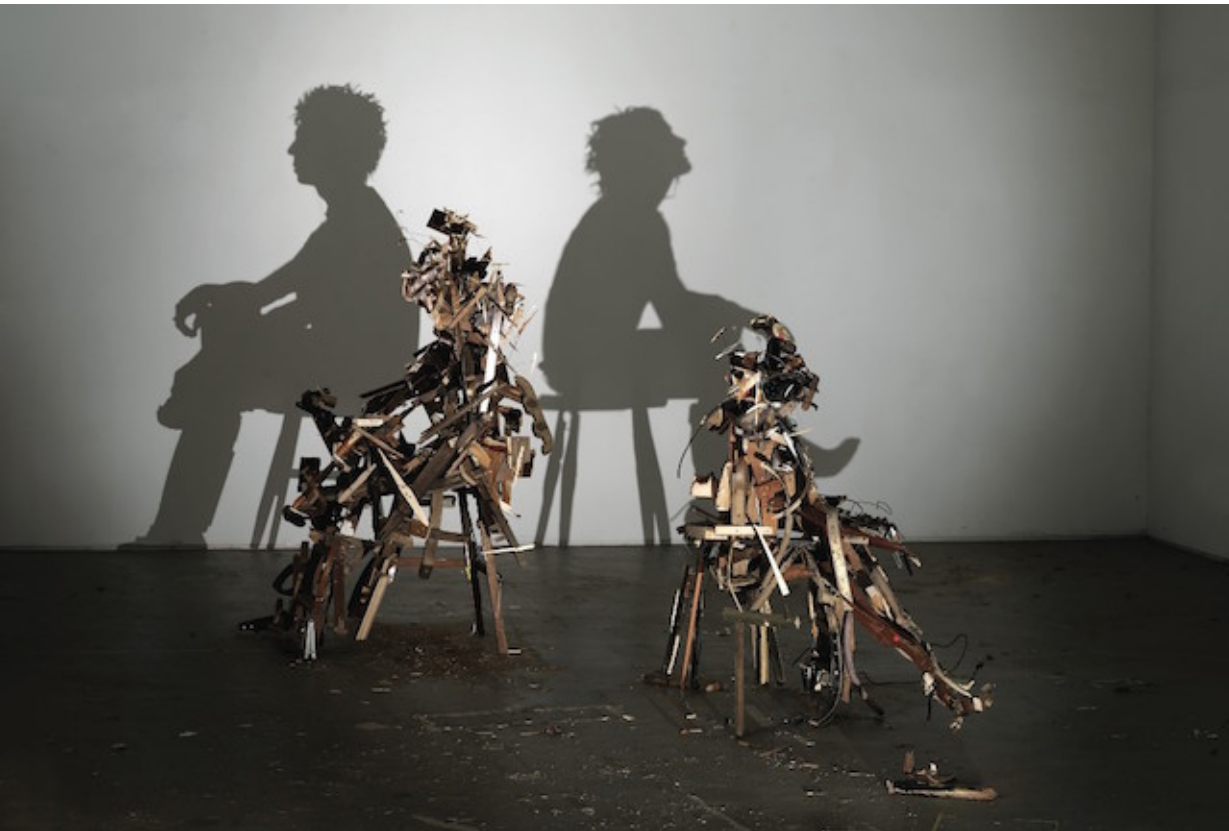
Tim Noble and Sue Webster, Wild Mood Swings Material: Recycled materials and rubbish